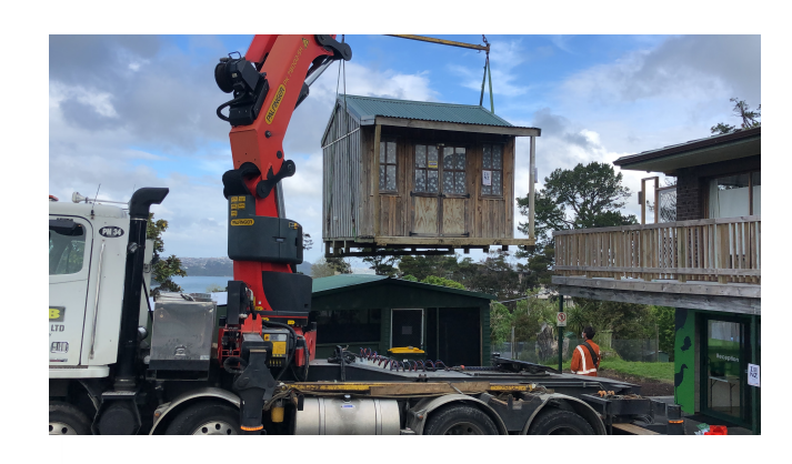
Hiab Transport Ltd