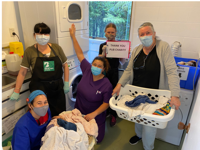
Pub Charity Ltd

Thanks to a Pub Charity Ltd grant, we have finally replaced our old and tired laundry equipment with a brand new Speed Queen washing machine and dryer. We are so delighted to have reliable and efficient laundry equipment, which will go a long way to helping ensure the highest standards of hygiene and comfort for our patients – as well as for our human staff and volunteers!